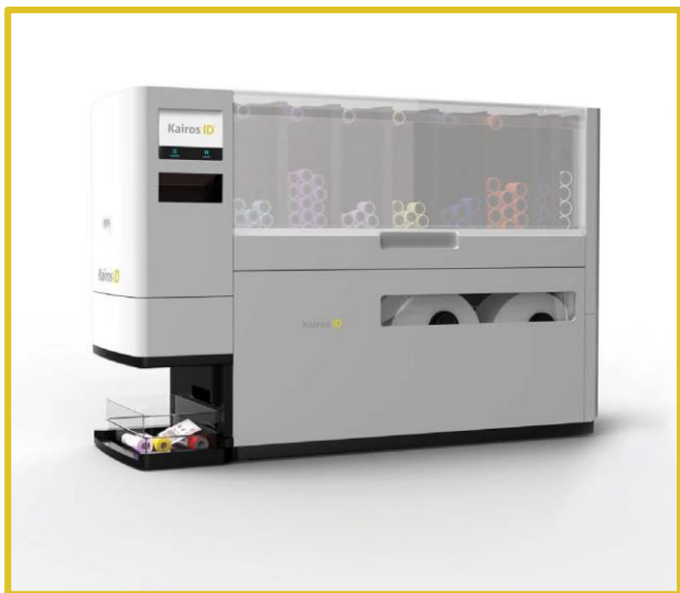
Kairos ID M Automated Tube Labeling System, Mini (Tabletop)

Kairos ID is an automated, on demand tube labeling system engineered to provide: